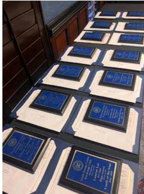
The Line-Up of SOCE YOY Award Plaques