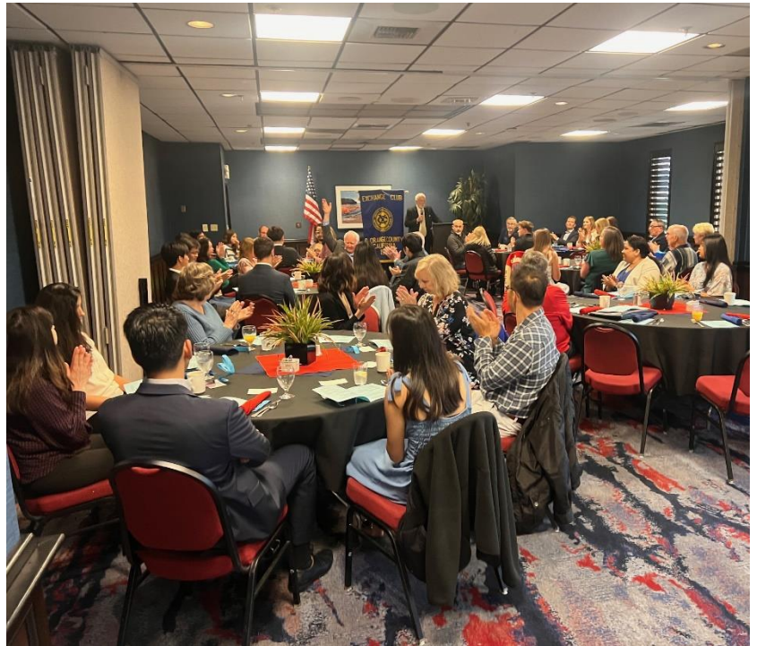
The room enlightened with the District President (arm raised) and all the Exchange Club Members Contributing to another successful Youth-of-the-Year Program